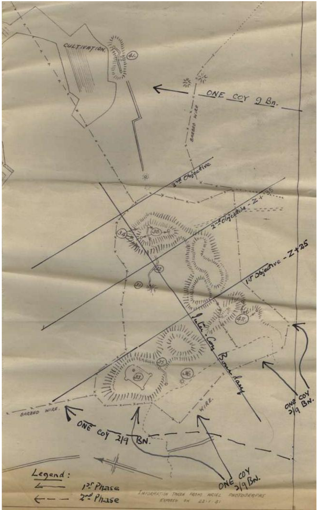
Map 2: An excerpt from a larger sketch map of Giarabub, showing the objectives of the 2/9th Battalion inside the Southern Redoubt.