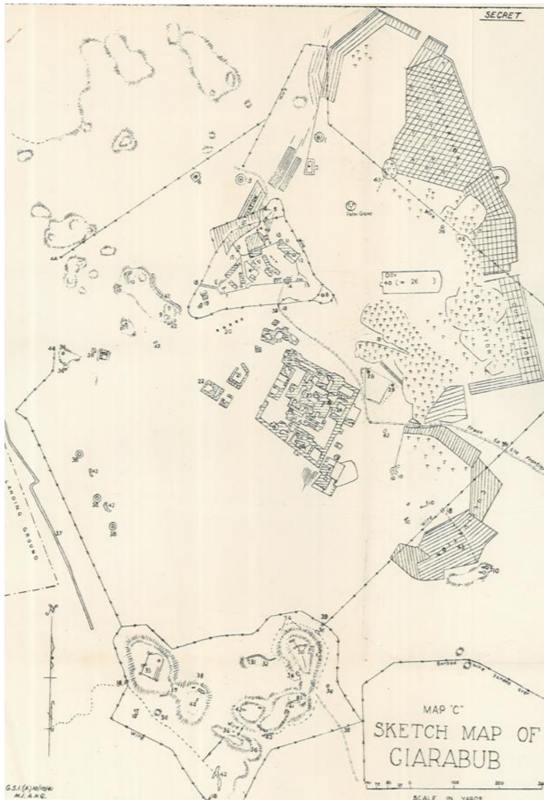
Map 3: The defences (part II): A map of Giarabub from the 6th Divisional Cavalry Regiment war diary. The southern redoubt can be seen at the bottom of the image.

AWM, SVSS paper, 2010 The siege of Giarabub, Tom Richardson